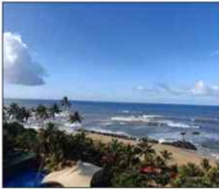
Beach at Galle

If you're sitting in Ranchi right now, scrolling through Instagram and seeing yet another video of Bali, stop. Look South. No, not to Goa—we all know how expensive a flight from Birsā Munda Airport to Dabolim has become, and let's not even talk about the taxi mafia there. I'm talking about the teardrop-shaped island that is quietly becoming the world's favorite tropical escape: Sri Lanka.