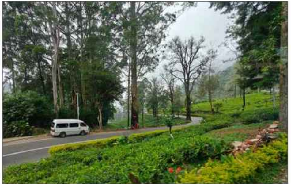
Tea Gardens at Nuwara Eliya