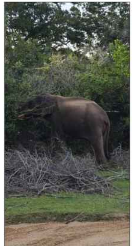
Yala National Park