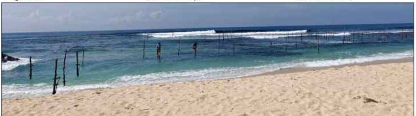
Traditional Fishing in Ahamgamma