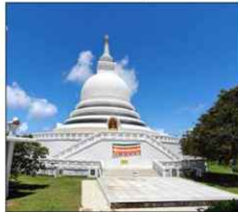
Japanese Peace Pagoda