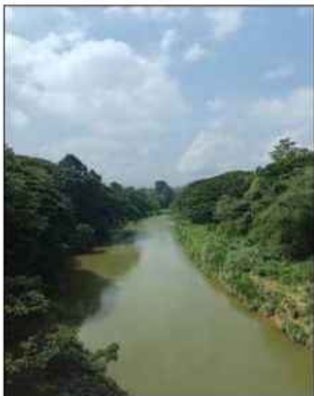
Bentota Back Water

capital. Don't make the mistake of treating this just as a transit point; Colombo is a vibe all its own. The moment you step out, the air is thick and tropical, smelling faintly of the sea and spices. You spend your first evening at the Lotus Tower, the tallest structure in South Asia. Standing on the observation deck, looking out at the glittering city lights meeting the dark Indian Ocean, you realize you've truly arrived.