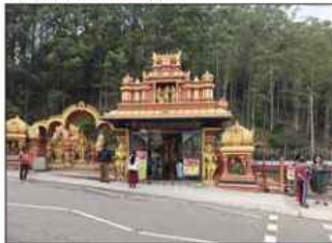
Sita Amma Temple